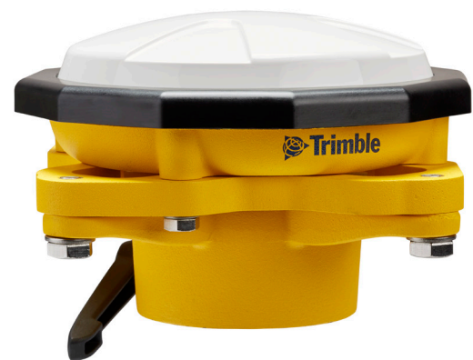
Picture 2: Zephyr 3 with 3" Mast Mounting PN 125000-10-INT