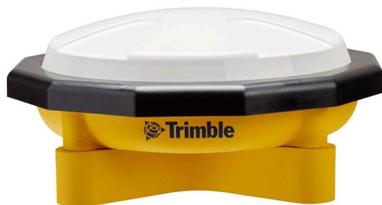
Picture 1: Zephyr 3 with 5/8" Mounting PN 125000-30-INT